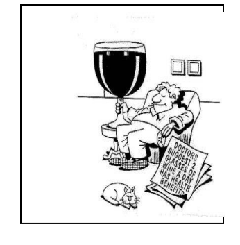
Doctors suggest 2 glasses of wine a day has health benefits!

Thank you for your understanding and cooperation.