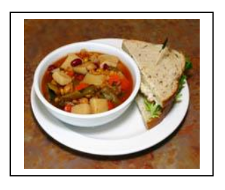
Fall "Soup & sandwich/Bake sale" November 7 from 11 – 1 pm Cost - $6/person

Our Fall "Soup, Sandwich and a Bake Sale" will take place on Sat., Nov. 7 from 11 am — 1 pm. Take-out/delivery is available. Cost is $6. Proceeds go to various mission/ministries locally and internationally. This is sponsored by the LWMLC and the FaithLife chapter.